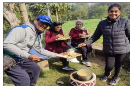
"Mangar Bani - ancient sacred grove"

Making peace with Nature is the defining task of the 21st Century, says United Nations Environment Programme (UNEP) report. To do so one has to learn and explore nature. That may be the motto behind the Environment Walk organized by Rotary, Delhi South East on 25th December 2022.