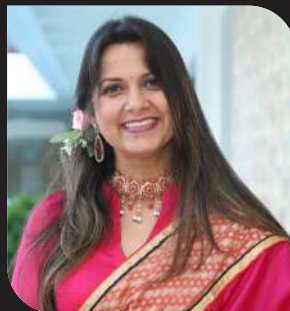
R'ann Jaya Dua